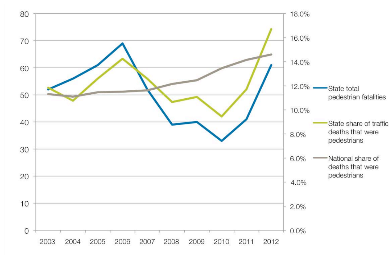
FIGURE 1 Pedestrian fatalities in New Mexico, 2003–2012

In the decade from 2003 through 2012, 504 people died while walking in New Mexico.