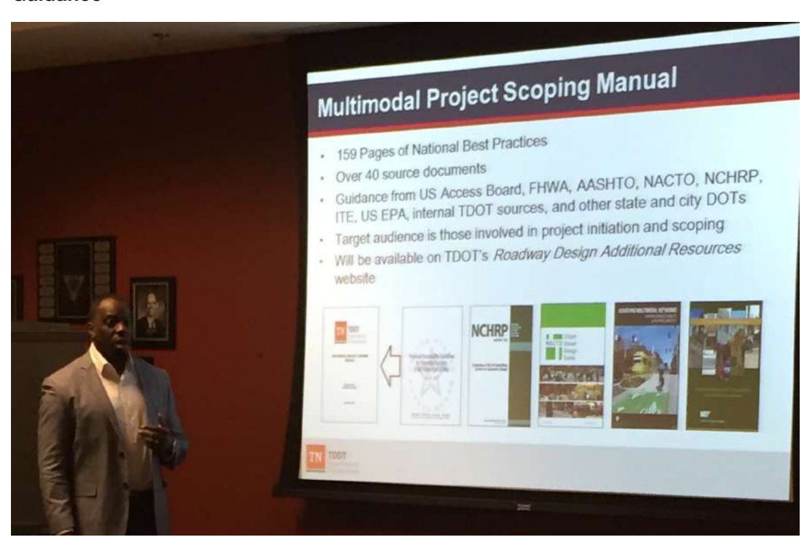
Strategy 2: Coordinate with TDOT to implement new Multimodal Project Design Guidance

The Chattanooga TPO, Nashville Area MPO, and Knoxville Regional TPO should designate an individual, task force, or other internal body to routinely review TDOT's upcoming resurfacing schedule as soon as it is made available online. This designated body could be administered collaboratively across the three regions or individually within each region and could include technical transportation staff from local and regional agencies. The review process should include cross-checking the resurfacing schedule for corridors that local and regional agencies have specifically prioritized for future Complete Streets improvements in master plans, that fill in gaps in the pedestrian and bicycle networks, and that community members have identified as priorities through public outreach. As a result of this review process, the Chattanooga TPO, Nashville Area MPO, and Knoxville Regional TPO should proactively communicate with TDOT's Office of Community Transportation and Bicycle and Pedestrian Coordinator about incorporating Complete Streets infrastructure in specific, upcoming resurfacing projects and remain engaged as the projects move through the design process.