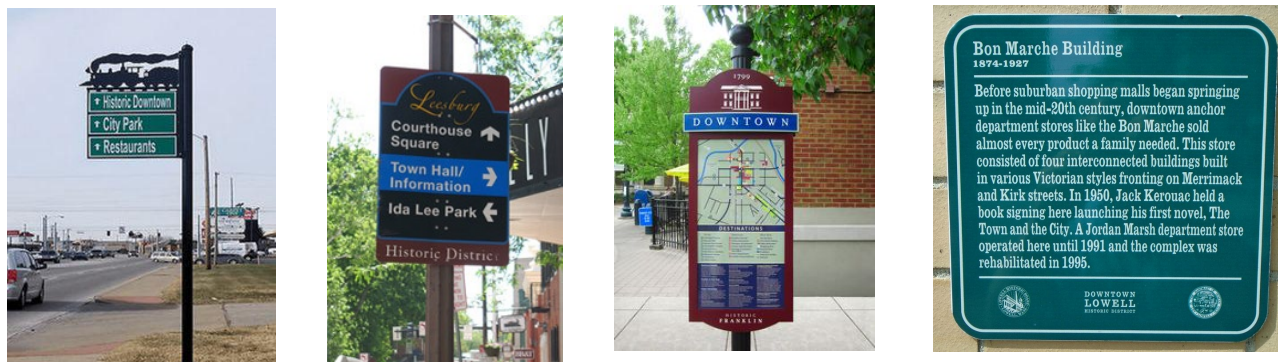
Examples of trailblazing signs (left two photos), wayfinding sign (center right photo), and historical marker (far right photo).