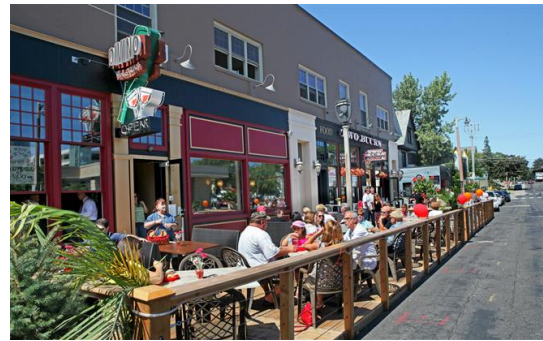
Example of on-street parking temporarily repurposed as dining