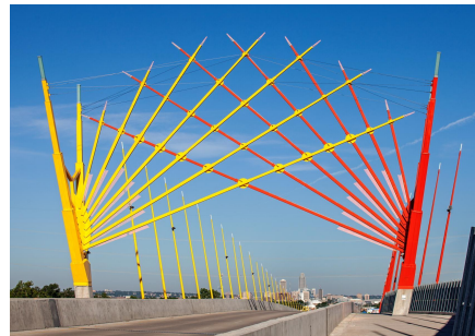
Arrival gateway in Council Bluffs, Iowa.

As the above examples show, this monument differs greatly from a landscaped “Welcome to Natchez” sign that might be placed at the very edge of the community.