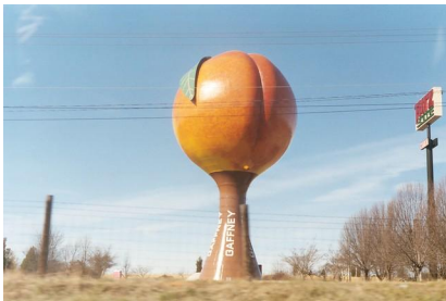
Peachoid water tower in Gaffney, Georgia.

The photos below offer two different levels of utilization of water towers for a community marketing purpose. We are not suggesting that Natchez replace an existing water tower solely for this purpose, but these photos are offered a range of suggestions from something that could easily be deployed now to a design that could be implemented at the end of an existing water tower's life cycle. Consider expanding branding to the many water towers within the community.