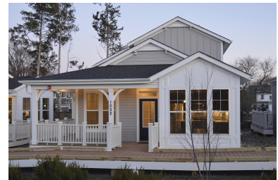
Photos of small format residential units and small lot homes suitable for a community like Natchez.