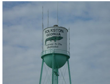
Water tower in Folkston, Georgia.