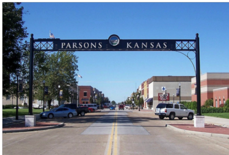
Monument in Parsons, Kansas.

Consider including elements of the branding campaign described above into the design of the monument.