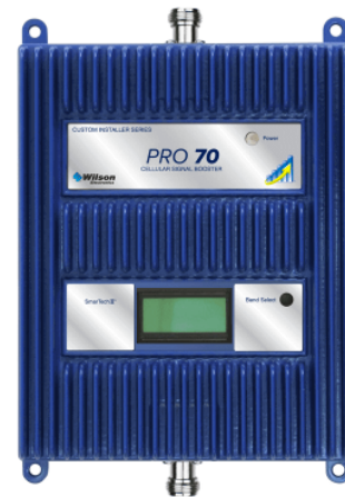
Example of a cell phone booster

Cellular phone boosters can improve reception in identified areas where signals are limited. By examining results of the broadband and cellular phone survey the SGA team conducted in Natchez and partnering with providers, Natchez can improve signal strength and quality. An RFP for the boosters and installation is needed to move this project.