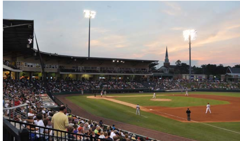
Fluor Field in Greenville's West End was built on the site of a former lumberyard.

In the 1980s, as other parts of the city's renaissance began to take hold, local leaders recognized the