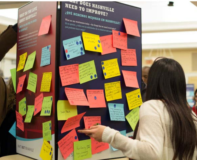
Participants in NashvilleNext.

Nashville's small business community won national attention in 2015 when the U.S. Small Business Administration selected the city to participate in its ScaleUp America Initiative, a program designed to assist high growth potential businesses in a wide range of industries. 114 The attention came for good reason. The Nashville Chamber runs Business Studio, a resource center that provides entrepreneurs with mentoring, financing, education, and strategic planning assistance. And that's hardly the only resource for entrepreneurs. Refinery Nashville and the Nashville Entrepreneur Center both provides office space, resources, and mentorship for entrepreneurs—in rehabilitated industrial buildings, no less.