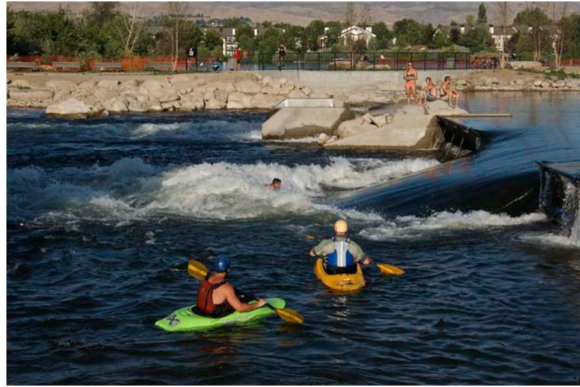
Kayakers in Boise River Park.

The project was made possible through a collaboration of public and private entities, including the City of Boise, private companies, foundations, and individual donors. Boise expects development near the park to continue, and has designated the area as a tax-increment financing eligible district. The second phase of the park renovation is slated to add a wading area, habitat island, spectator overlook, and amphitheater-style lawn for events along the river. 20