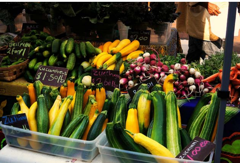
Produce at the Boise Farmers Market.

Its efforts are paying off: today, downtown Boise is home to 37,363 jobs—13.1 percent of all the jobs in the metro area—32 percent of which require at least some college education and 48.3 percent of which pay more than $19/hour. 14 Twenty-four new businesses opened in downtown Boise in 2015, and the office vacancy rate at the end of that year was just 6.93 percent. 15 One of downtown's recent signature developments is Eighth & Main, an 18-story, 390,000 square foot, Class-A office and retail building constructed on one of the city's most blighted downtown properties that opened in 2014.