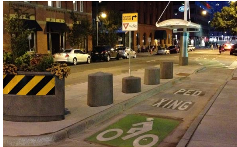
A bike lane routes around a bus stop in Denver.

A major part of the FasTracks plan included redeveloping Downtown Union Station, a historic train terminal built in 1881 and its accompanying 42 acres of rail yards in the neighborhood now known as Lower Downtown, or "LoDo".