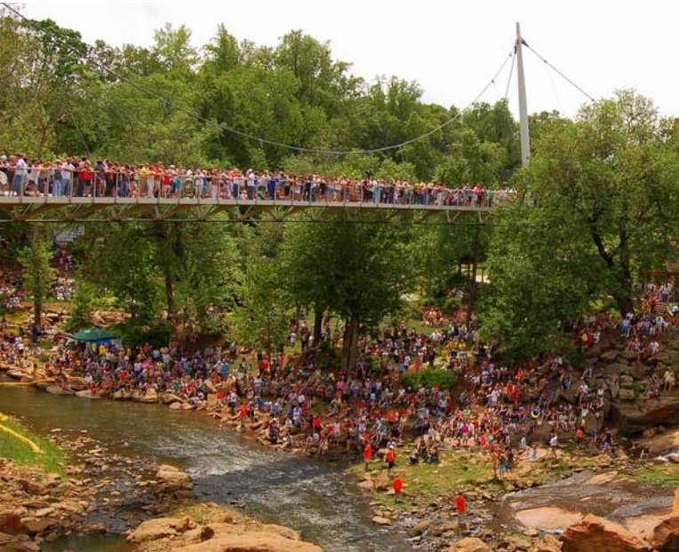
The Reedy River “Duck Derby” has become a local tradition since the park’s opening.

river's potential as a community gathering space. The city worked with the South Carolina Department of Transportation and the Federal Highway Administration to evaluate and eventually demolish the