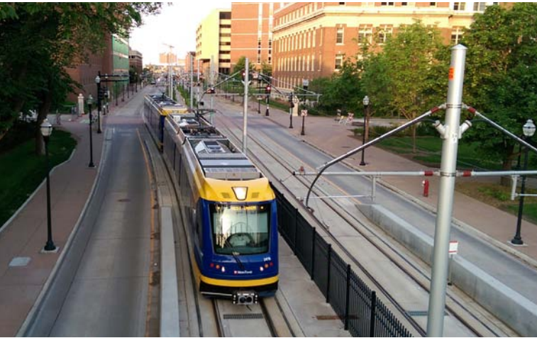
The Green Line as it runs through the campus of the University of Minnesota.

the streets are too narrow or the area too developed for light rail to be considered feasible. The next line in the rapid bus network is now beginning detailed design and engineering and is expected to open by 2019. By 2030, Minneapolis' rapid bus network is slated to span more than 100 miles, including more than 400 stations and providing approximately one-third of the region's average weekday rides.