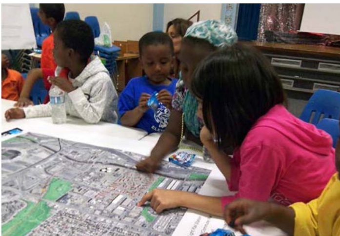
Community outreach meetings part of the Decatur-Federal Station Area Plan in Sun Valley.