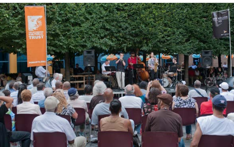
An evening concert with the Pittsburgh Cultural Trust at Agnes R. Katz Plaza in the Cultural District.

Pittsburgh’s steel barons built dozens of beautiful theaters in the 1800s, but by the early 1980s the city’s once-thriving theater neighborhood had fallen into disrepair and become a seedy red-light district. The non-profit Pittsburgh Cultural Trust set out to change that, and beginning in 1984 began working to restore downtown Pittsburgh to its former status as a cultural powerhouse. Realizing that a piecemeal approach to rehabilitation would not achieve their goals for the area, they developed a robust suite of services including real estate development, historic restoration, public space beautification, and public art projects. The Trust also invested directly in the neighborhood and now owns and maintains several theaters, galleries, and additional mixed-use properties in the neighborhood. 121 Today, the Cultural District is the backbone for the City’s performing arts and culture scenes, which in 2015 hosted more than 4,700 exhibits and 1.9 million event attendees. 122