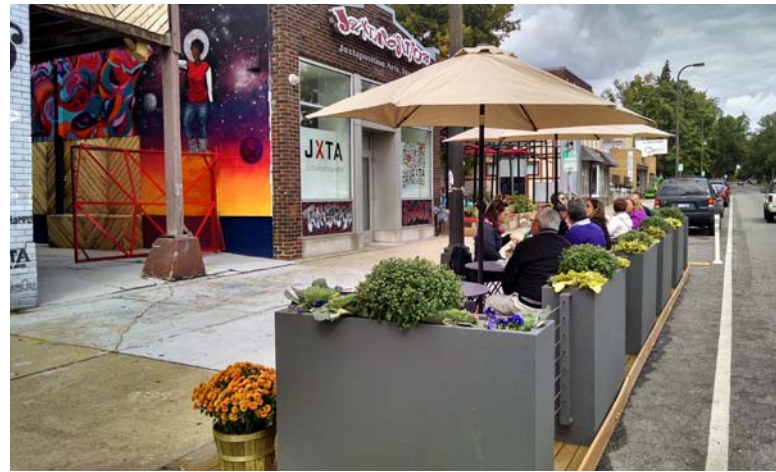
An outdoor cafe made possible as part of Minneapolis' parklets program.

A new football stadium, rail service from St. Paul and the Mall of America, massive new offices for Wells Fargo, and a centerpiece park known as The Commons are just some of the new projects fueling a development boom in Minneapolis' Downtown East neighborhood. 93 Once the heart of the city's historic Mill District, in recent years Downtown East had become "a geographical no-man's land." 94 Today, the slate of proposed and under-construction projects is formidable: more than 1,000 condos and apartments are being planned, along with an upscale grocery store, and smaller commercial spaces. The neighborhood is now home to innovative firms like the creative agency Humdinger & Sons, the online publisher Periscope, and the design-friendly paint firm Valspar—as well as the young, educated people who want to work there. The City, for its part, is working to support the new neighborhood with public space improvements like street trees and plantings, wayfinding signs, placemaking projects like parklets, and improvements to infrastructure designed for people biking and walking.