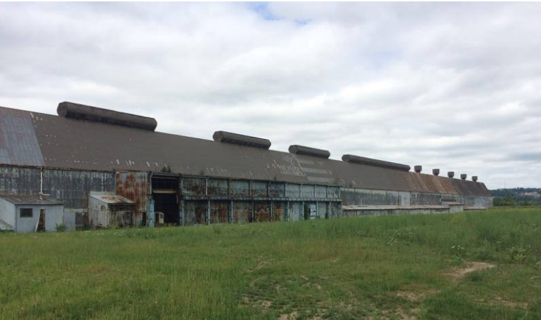
Mill 19 at Almono, slated to become a new home for the tech industry in Pittsburgh.

In 2002, four southwestern Pennsylvania foundations formed a limited partnership with the Regional Industrial Development Corporation of Southwestern Pennsylvania and purchased a 178-acre former steel mill site on the Monongahela River. After years of planning, community engagement, and site preparation, construction began in 2015 on what's now known as the Almono riverfront project, an effort to redevelop