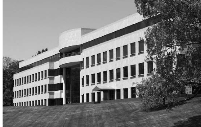
The old recipe: Enticing large employers with tax breaks and subsidies.

This approach helped some communities attract companies that have anchored long-term economic activity. However, there is an extensive and well-documented history of unproductive and even harmful outcomes from these incentives. Neighboring jurisdictions often simply stole businesses from one another, moving economic activity around without increasing it—at taxpayer expense. 1 Predicted jobs sometimes failed to appear, or the jobs created went to people living outside the community. 2 Other times the outrageously high subsidies per job created raised questions about whether these tradeoffs were worthwhile. 3 And too often businesses would leave once incentives expired 4 or would threaten to leave if new incentives weren't offered. 5 In many cases, communities won these companies at too high a cost—extending their finances at the expense of services for existing residents and businesses. But perhaps the biggest problem for economic development officials now is that this strategy often simply isn't working.