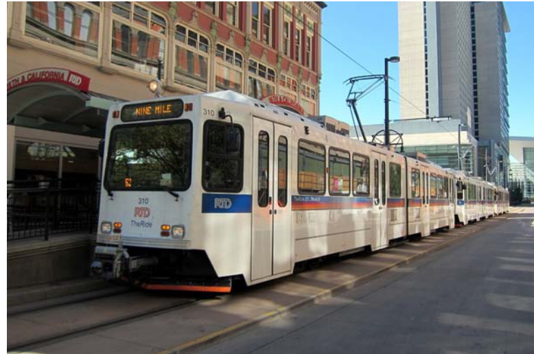
The H Line light rail, sometimes known as the Blue Line, operated by the Regional Transportation District.

The residential population of downtown Denver grew 86 percent from 2000 to 2012, and the population of neighborhoods within a 1.5-mile radius of downtown is projected to reach 73,877 by 2018. 33 With all this rising demand comes rising prices, and the City is working to make sure its most walkable areas remain affordable.