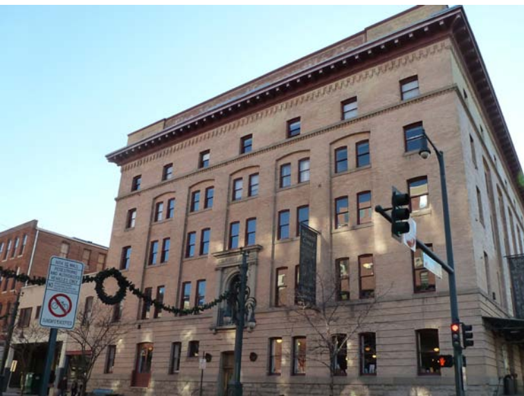
The Tattered Covered bookstore in LoDo, near Denver Union Station.

Planners aimed to make Union Station a multimodal hub from which all of FasTrack's light rail and bus lines would radiate. The hub now accommodates nine modes of transportation, including pedestrian and bicycle traffic, a commuter rail line that connects directly to the international airport, and light rail lines across the city. In addition, the redevelopment plans outline new apartments, offices, and retail space that, if successful, would transform Union Station into an economic centerpiece of the city.