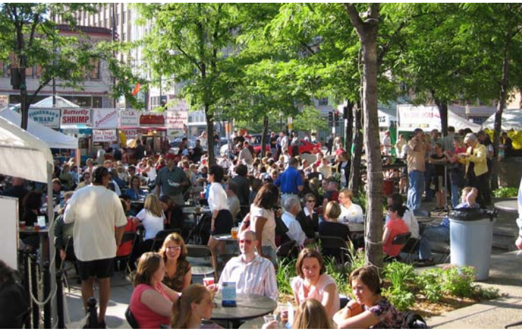
Peavey Plaza on the Nicollet Mall.

Built in 1968 as part of a public/private partnership to support real estate values, downtown Minneapolis's Nicollet Mall was the nation's first transit and pedestrian mall. 69 Today the Mall is a beautiful and inviting place for people to stroll or sit, with wide sidewalks, tree-lined streets, and outdoor seating. It's also home