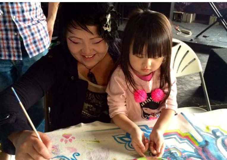
Installations and activities part of the Irrigate project.

Performing arts, fine arts, design, writing, and publishing are a huge part of what makes Minneapolis an attractive place to live. The city is home to world-class museums, galleries and performing arts venues. The Northeast Minneapolis Arts District was named the best in the country by USA Today readers in 2015. 76 And the city is actively working to create an Arts Corridor with street-level galleries, studio spaces, performances and public installations along Hennepin Avenue, from the Walker Art Center to the Riverfront. 77