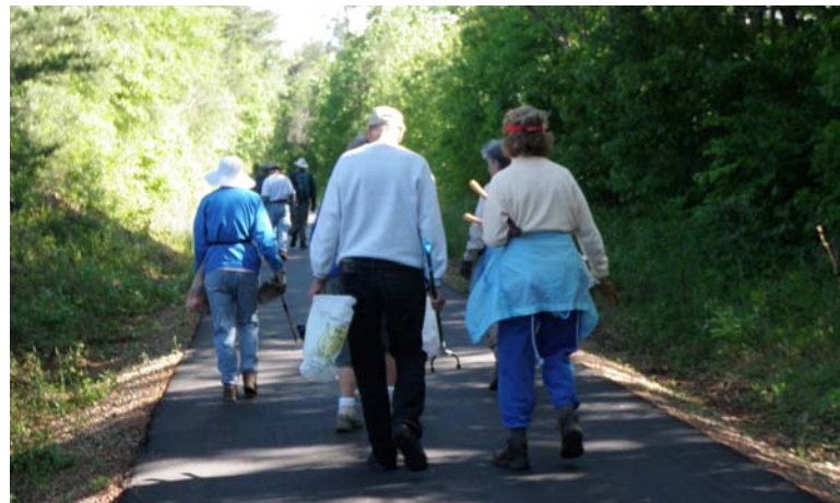
People bicycling and walking along portions of Greenville's Swamp Rabbit Trail.