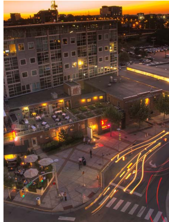
Sunset over The Gulch neighborhood.

Nashville's transit system is still in its infancy, and leaders from across the region are working together to change that. The Nashville Area Metropolitan Planning Organization (MPO) is working to include transportation in its land use work. In 2005, the organization adopted the region's first long-range transportation plan, which aimed to better connect land use and transportation decisions, create multimodal transportation options, reduce congestion, and better manage financial resources. 102 Ten years later, in early 2016, the MPO adopted its latest unified plan for transportation: Middle Tennessee Connected assesses the current state of transportation in the region and lays out new goals to achieve between now and 2040. 103