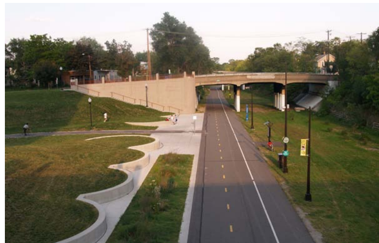
Minneapolis' Midtown Greenway.

Most cities would consider a neglected railroad corridor to be an economic liability, not an opportunity. But with a significant investment from Hennepin County, Minneapolis has transformed this remainder of its grain-milling era into a catalytic infrastructure investment. The 5.5-mile Midtown Greenway is a “bicycle highway” built on the former industrial rail right-of-way that connects to popular destinations such as the Minneapolis Chain of Lakes, Uptown, Midtown Exchange, and the Mississippi River, and runs parallel to the Lake Street commercial corridor with hundreds of retailers, restaurants, and other businesses. Lit at night, plowed in the winter, and open 24/7, the Greenway is enjoyed by several thousand people every day. Since the Greenway's launch in 2000, more than 2,700 housing units and over 1 million square feet of commercial space have been constructed along the trail. From 2005 to 2014, $750 million of building permit activity occurred within a quarter-mile of the Greenway, and property values increased 98 percent from 2001 to 2013. 72