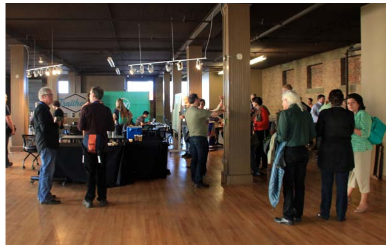
An event at Trailhead.