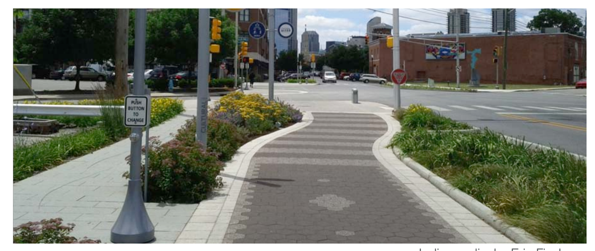
Indianapolis, by Eric Fischer

Planning and designing our streets for people on foot, in addition to those traveling by public transportation, bicycle and automobile, is the most important approach to improving street safety. Without sidewalks, safe and convenient street crossings, and slower design speeds, no amount of programmatic or regulatory efforts will curb the epidemic of pedestrian deaths.