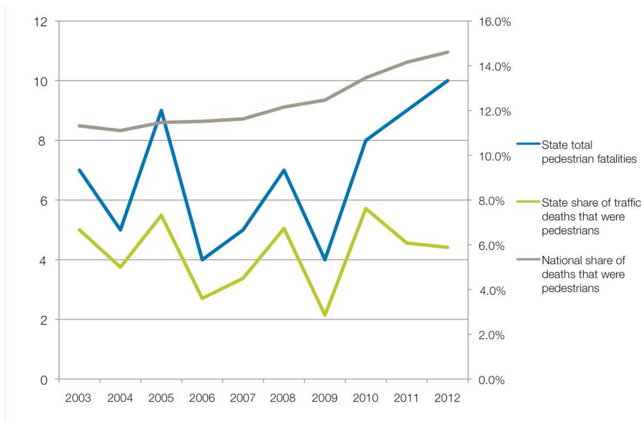
FIGURE 1 Pedestrian fatalities in North Dakota, 2003–2012

In the decade from 2003 through 2012, 68 people died while walking in North Dakota.