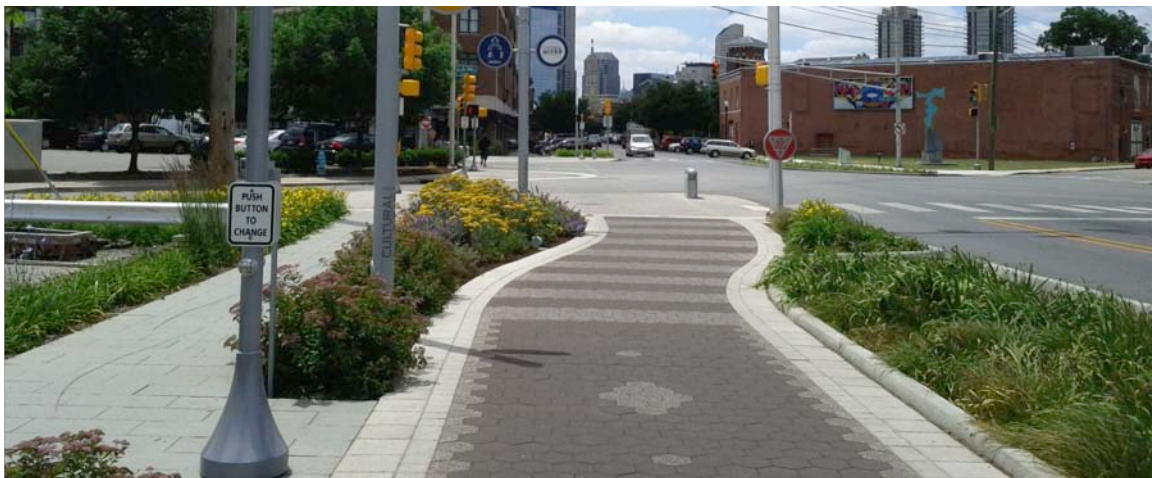
Indianapolis, by Eric Fischer

Planning and designing our streets for people on foot, in addition to those traveling by public transportation, bicycle and automobile, is the most important approach to improving street safety. Without sidewalks, safe and convenient street crossings, and slower design speeds, no amount of programmatic or regulatory efforts will curb the epidemic of pedestrian deaths.