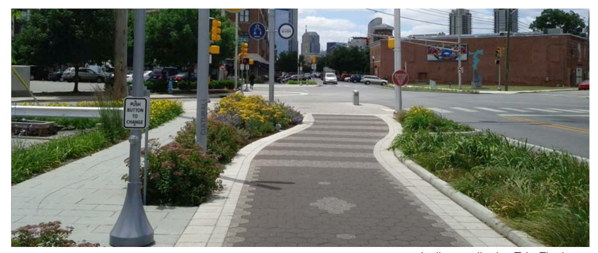
Indianapolis, by Eric Fischer

Planning and designing our streets for people on foot, in addition to those traveling by public transportation, bicycle and automobile, is the most important approach to improving street safety. Without sidewalks, safe and convenient street crossings, and slower design speeds, no amount of programmatic or regulatory efforts will curb the epidemic of pedestrian deaths.